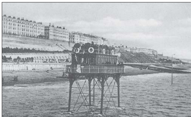
Postcard of the Daddy Long Legs, the unique sea going tramway which ran from Paston Place, Brighton to Rottingdean.