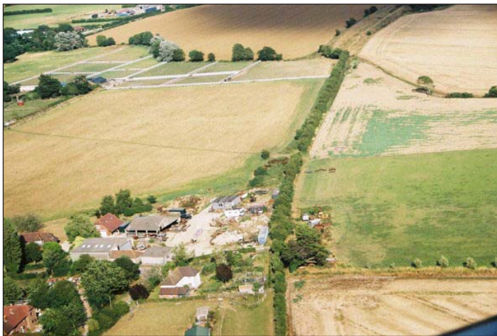
Tile Barn Farm, Barnham, from the air, looking east. The canal route is from the centre bottom to the top of the picture where the canal profile can be seen. The line of trees in between, are the towpath line. The footpath across the field on the left meets the canal at the site of a former swing bridge crossing the canal. An SIAS interpretation board is at the surviving pivot support stone for the bridge. Continuing east is the Denges Barn embankment and Yapton. (C. Bryan)