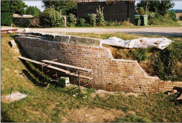
Stewart Swing Bridge Site, Barnham Court Farm. The South wall of the bridge support. The coping stones and most of the brickwork was reinstated over the last two years using lime mortar and salvaged original bricks. The rebate for the bridge to swing into can be clearly seen on the coping stones.