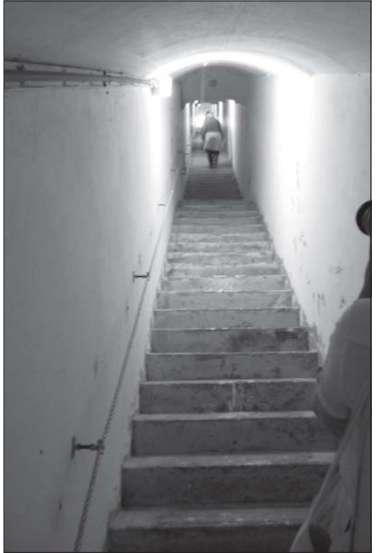
View up the Roedean Tunnel from the bottom. Roedean girls sat on cushions during air raids in WW II, before being relocated to Keswick, the school was then used as H.M.S. Vernon. (Martin Snow)

The tunnel was built in 1911 to enable access to the beach direct from within the grounds to enable the girls to swim in privacy and use a sailing boat that was housed in an adjacent excavation (long gone). The tunnel is dry throughout, three feet wide with occasional landings. At the bottom there are steps up to a heavy steel door, originally the tunnel would have opened straight onto the beach at the lowest level and probably some distance further out than today. The Undercliff Walk was built in the 1930s as part of the coast protection works, at a higher level this requires the steps up to the present heavily engineered exit, there is also evidence of the cliff having retreated further back since that time. The original cliff base is marked by the curb with pebble infill to the present base of the cliff.