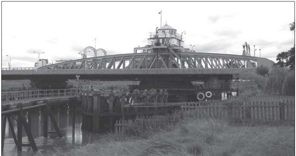
Port Sutton Bridge

http://www.industrial-archaeology.org.uk