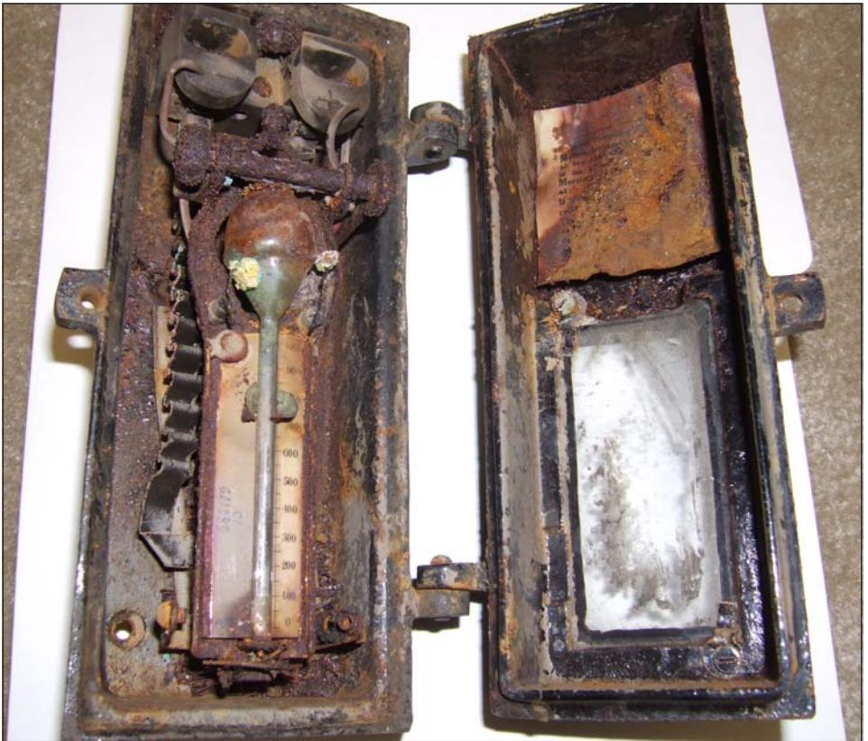
A mystery solved An electrolytic meter for DC power supplies. Manufactured in Brighton from 1901 (Jeff Krebs)